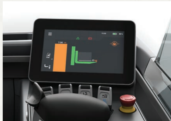
Interactive touchscreen display